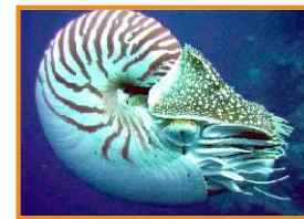
A nautilus pumps water through its muscular foot for jet propulsion!