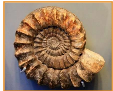
One of many extinct species of ancient ammonites

The diversity of molluscs shows how a basic body plan can evolve into a variety of different forms. They were able to adapt for survival on land, shallow waters, and in the deep ocean. Modern molluscs range from microscopic organisms the size of a grain of sand to the giant squid, which can be over 21 meters (70 feet) long! There are about 85,000 named living species of molluscs, and likely an astounding 200,000 species in all. They are the largest marine phylum.