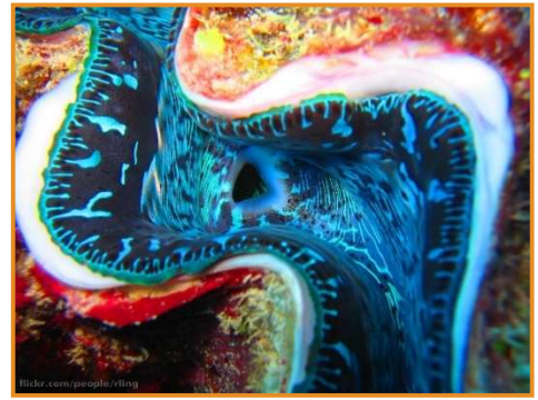
The dazzling blue mantle of a giant clam: The hole in the center is its siphon, a tube-like structure that draws water in and out of the mantle cavity.