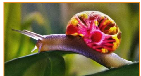
One of many species of mollusc with a vibrant, spiral shell