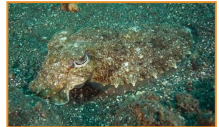
Can you see it? Cuttlefish know how to blend in.