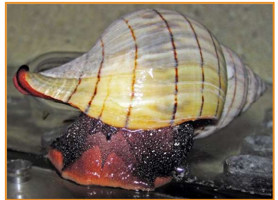
A banded tulip snail ( Fasciolaria hunteria) moves using its muscular foot.

Molluscs evolved about 500 million years ago. They began as bottom feeders, but some evolved to swim, like the now-extinct ammonites . These large, spiral-shelled predators filled ancient seas. Their closest modern relatives are octopuses, squid, and cuttlefish.