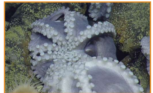
A deep-sea octopus guards her eggs.